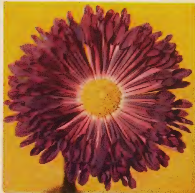
GARNET SPOON. 60c each; 3 for $1.50

7 Sterling Spoons Truly the very best in spoon varieties 7 Sure-to-Bloom Plants $3.50 (1 of each pictured)